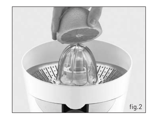
the juicing cone will begin to rotate. To stop, lift the fruit off the cone. Juicing will automatically stop.